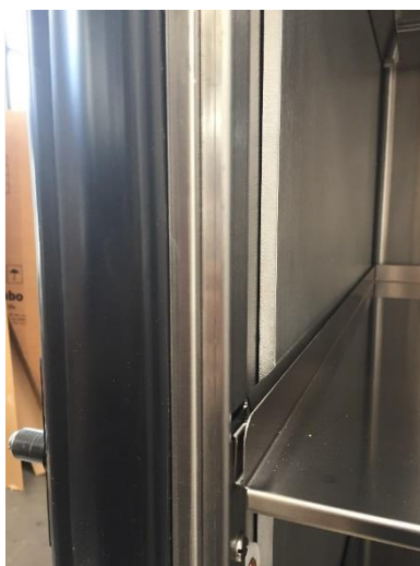
Photo 3 : Cryo-accumulator plates situated on the right part of a freezer, three-quarter interior view