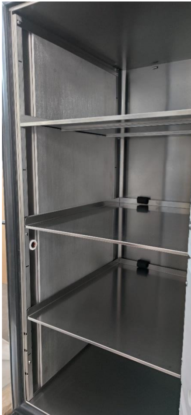
Picture 1 : Cryo-accumulator plate situated on the left part of a freezer, full inside left view

To visualize the location of the cryo-accumulators in the tank of a freezer, photos are available below.