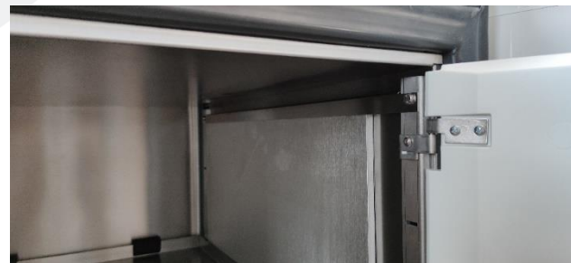
Photo 4 : Cryo-accumulator plates situated on the right part of a freezer, right up inside corner view