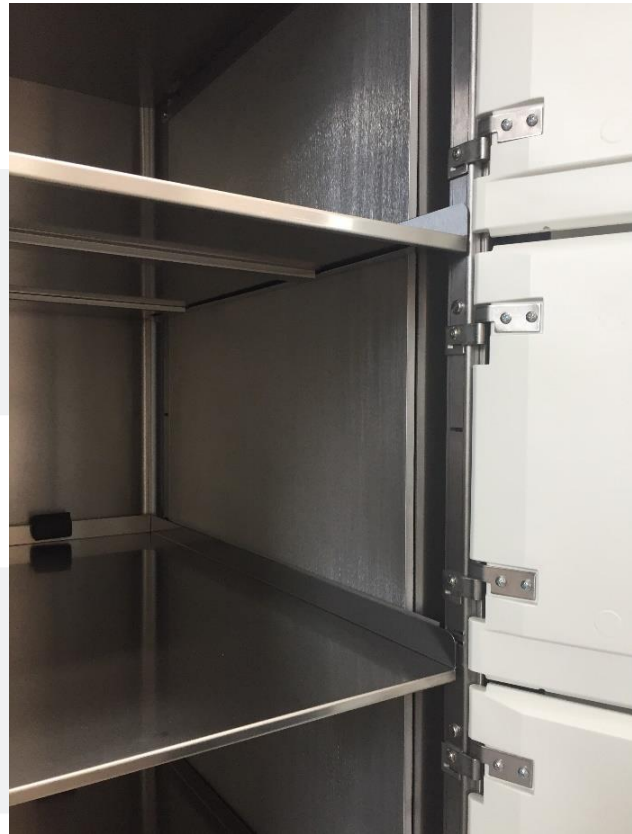
Picture 2 : Cryo-accumulator plate situated on the right part of a freezer, central inside right view